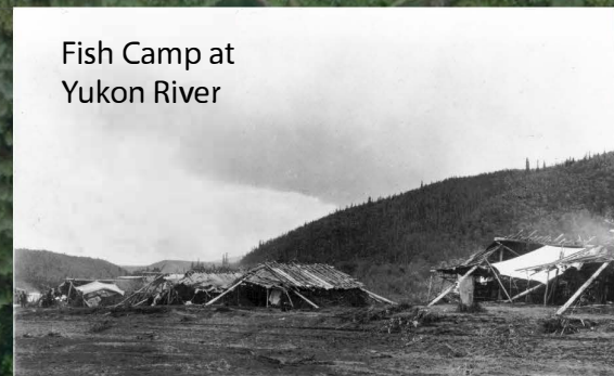
Fish Camp at Yukon River