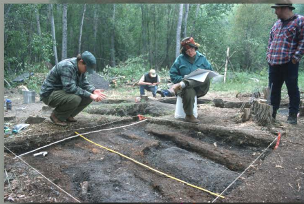
Yukon College Field School 1999