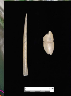
Bone tools Klondike River